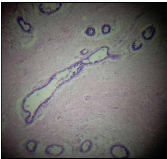
Fig-4: Proliferation of stromal and epithelial fragments (H & E: 10X)