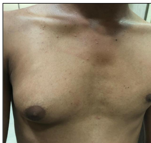
Fig-1: Gynecomastia of right breast

A male patient aged 25 years presented with right sided gynecomastia was referred for FNAC. On examination, a swelling measuring approximately 3x2 cm, soft to firm in consistency and freely mobile was present in the right breast. There were no other abnormal findings (figure 1). The left breast was normal. FNAC was done and cytological smears showed many scattered bare bipolar nuclei and few stromal fragments and occasional stag-horn pattern arrangement of cell clusters. There was no cellular atypia (figure 2 and 3). A diagnosis of fibroadenoma was made based on the above findings. This patient underwent lumpectomy and a confirmatory diagnosis of fibroadenoma was made histopathology (figure 4).