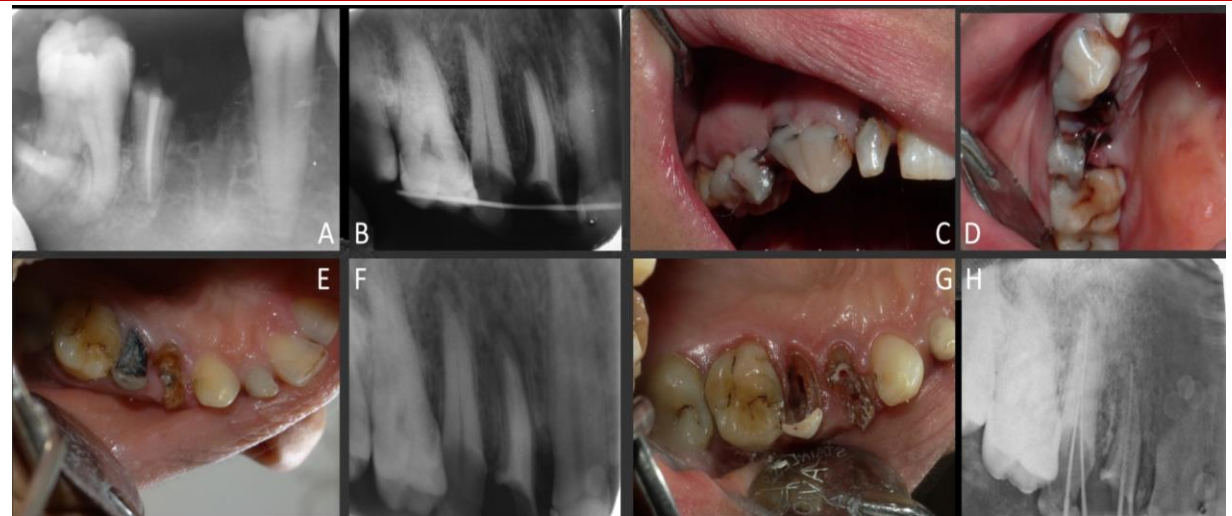
Figure 2: During preparatory phase as removal of mesial root of tooth # 46 (A), root autoimplanation in area of tooth #14 and splinting (B-G), RCT (H)