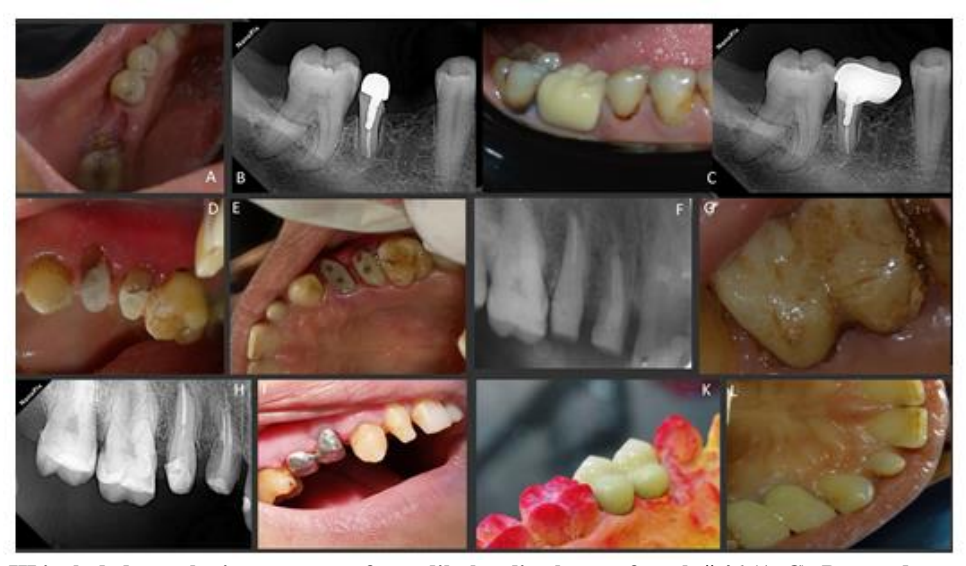
Figure 4: Phase III included prosthetic treatment of mandibular distal root of tooth # 46 (A-C). Post and core buildup of teeth 14, and 15, and prosthodontic steps (D-L)