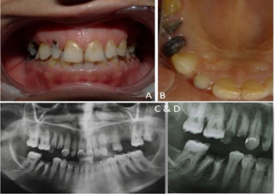
Figure 1: Preoperative intraoral view A-B, and OPG (C-D)

Phase III: custom made post and core was constructed, followed by a porcelain fused to metal cantilever bridge to replace the hem-sectioned mesial crown (Figure 4 A-C). Glass fiber posts and composite build up were done for teeth # 14 and 15 (Figure 4 D-G). After 12 months, the final teeth preparation was done following the principles and guidelines for tooth preparation of full crowns, wax-up of crowns, metal tryin, and porcelain build-up then try in as well as occlusal adjustment during different mandibular movements were done (Figure 4 H-K). Finally, cementation of the two crowns with glass ionomer cement (Figure 4 L), followed by immediate intraoral photo as well as periapical x-ray (Figure 5 A-B). All the laboratory and clinical steps were followed by the recommendation and instruction of each material used alone. Phase IV: The patient was followed up after 12 and 24 months, and preapical radiograph was taken at these intervals (Figure 5C).