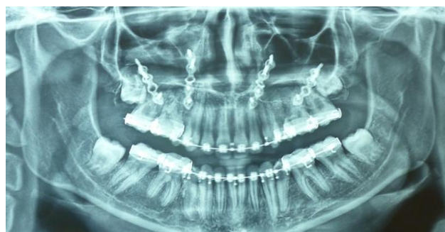
Fig 11: Post-treatment panoramic radiograph

Lastly, a panoramic radiograph shows satisfying root parallelism and good bone healing (Figure 11).