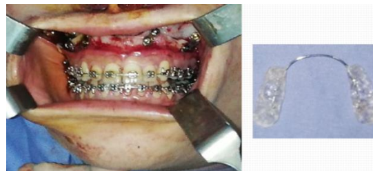
Fig 7: Surgical stage

diastemas, wearing intermaxillary elastics, performing wire artistic bends and Occlusal equilibration for the conclusion of the case (Figure 7).