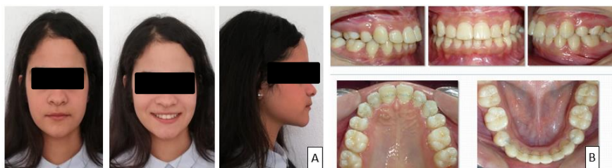
Fig 8: Post-treatment photographs. A, facial photographs. B, intra-oral photographs

fixed retainer in both the maxillary and the mandibular arches and posttreatment records were taken (Figure 8).