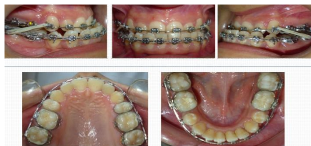
Fig 4: Progress photographs : aggravation of the cl III malocclusion by using class II intermaxillary elastics

After that, dental decompensation was completed by aggravation of the Class III malocclusion by Class II mechanics (Figure 4).