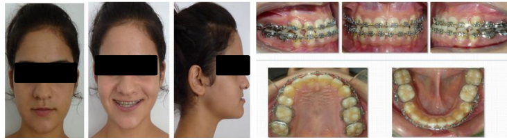
Fig 6: Presurgical photographs showing upper and lower surgical 0.019” x 0.025” stainless steel archwires for intermaxillary fixation

was planned according to facial analysis, predictive cephalometric tracing, and preparation of the surgical guide (Figure 6).