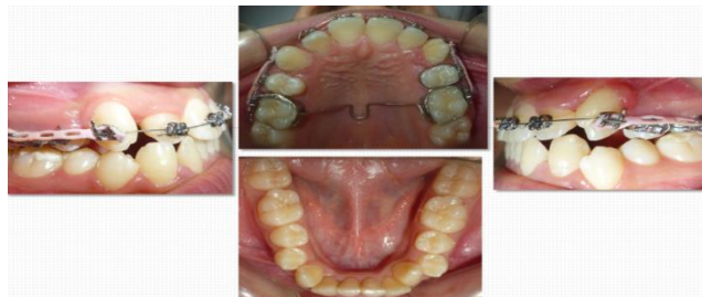
Fig 3: Progress photographs : Upper canines retraction on a 0.018” ss archwire

Then, the upper canines were retracted on a 0.018” stainless steel archwire (Figure 3).