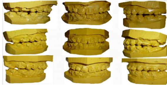
Fig 5: Presurgical dental casts

At this phase, dental impressions were taken to help in the presurgical preparation. The intercuspitation was checked by occluding the plaster models that were periodically obtained until satisfactory occlusion was attained for performing the surgery (Figure 5).