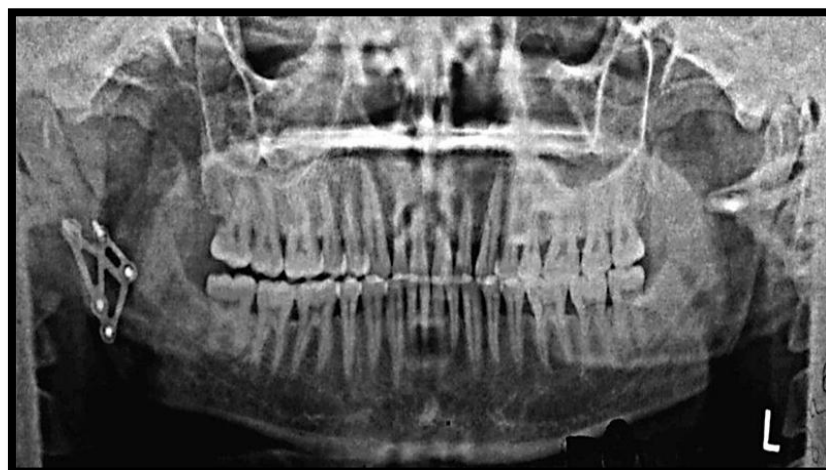
Fig-5: Shows Post-operative OPG

Four patients underwent postoperative intermaxillary fixation for a period of one week and an extended duration of up to 6 weeks. This was done in patients with bilateral condylar fracture whereas a high condylar fracture case was conservatively managed. Postoperative edema and swelling were minimal with no incidence of wound infection. Weakness of the temporal branch of facial nerve was noted in one of the patients in whom frontotemporal incision was performed. Postoperative radiograph (fig.5) was taken to check the reduction of fracture segments and follow-up was done for a period of 6months to 1year.