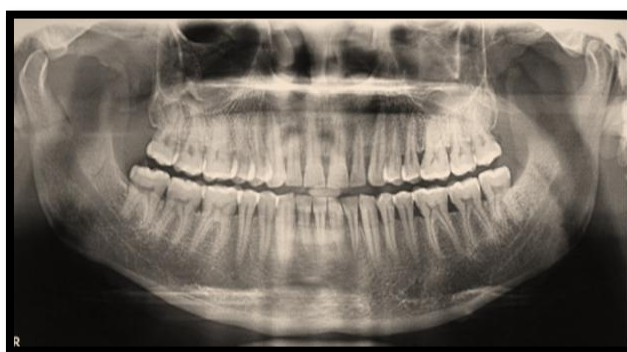
Fig-1: shows Preoperative OPG

The study was performed in the Oral and Maxillofacial Surgery department at Rajah Muthiah Dental College and Hospital, Chidambaram, Tamilnadu, which was approved by the Ethical Committee of Institutional review board. Six patients with age ranging between 16 and 26 years with sub-condylar fractures were selected. Patients with associated fractures were also included in the study. These patients had undergone surgery with open reduction and internal fixation using 3D strut plates. The informed written consent form was obtained before the study from all the patients. Preoperative OPG was taken to evaluate the fracture site which can be seen in fig.1.