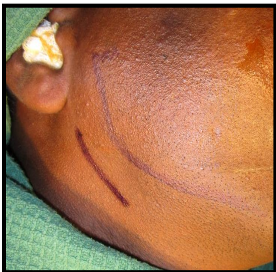
Fig-3: shows Retromandibular incision

sigmoid notch and stabilized using 2 x 8 mm titanium screws (5 in number). All the patients underwent intermaxillary fixation using arch bars. Out of 6 patients, 5 patients had associated fractures, where an existing extraoral chin incision was placed in one patient and an intraoral vestibular approach was done for the remaining 4 cases. Associated Zygomatic complex fracture in one case was managed using fronto-temporal approach. All the patients were given a high dose of antibiotics and steroids. Strict oral hygiene instructions were given to patients.