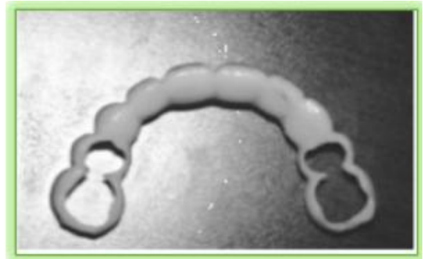
Occlusal surface of Snap on Smile [12]

thermoplastics. This material is non-toxic and is also used in the replacements of heart valves and other minor dental appliances.