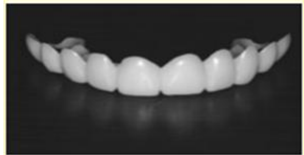
Facial surface of Snap on Smile [12]

The snap on smile is the flexible and adjustable device that needs no preparation or reconstruction of the tooth structure; it doesn't require any anaesthetic injections or cementation procedures. In fact it is non-invasive that makes it perfectly reversible [13].