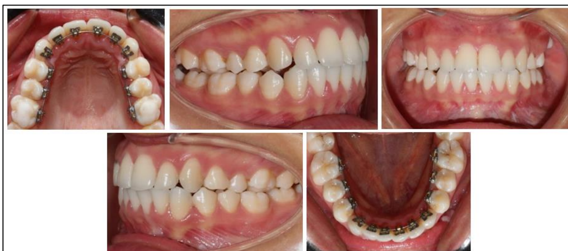
Figure 6: Correction of crowding in both the upper and lower arches

After 12 months, the 31 was placed, and maxillary and mandibular leveling was achieved.