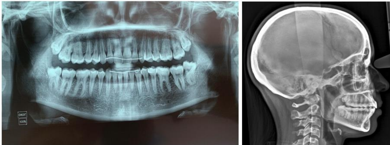
Figure 9: Post-treatment radiographs

The cephalometric analysis, along with both local and general superimpositions, reveals a slight lower alveolar protrusion compared to the start of treatment (Figure 9 & 10).