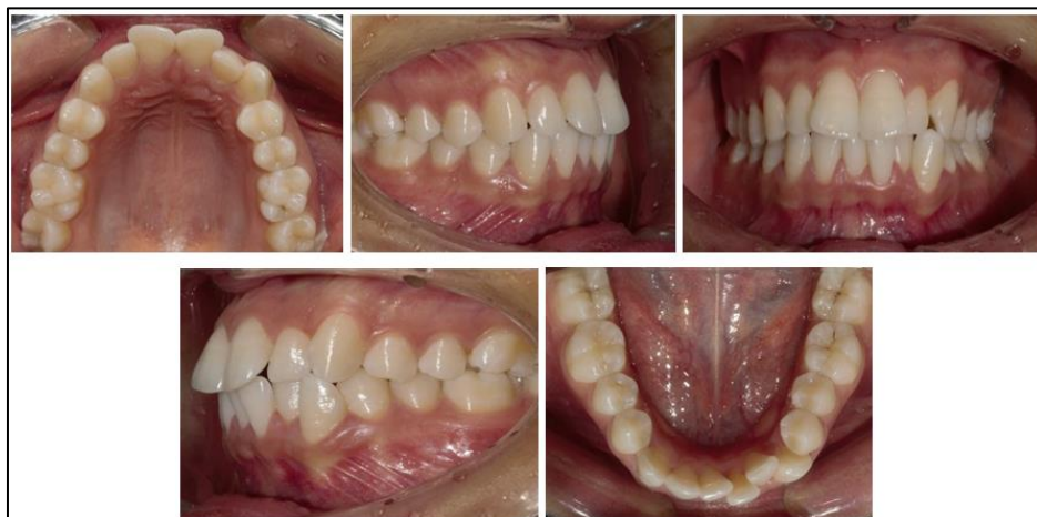
Figure 2: Pre-treatment endo-oral photographs

in both the upper and lower arches. There is also a deviation of the lower midline towards the left side (Figure 2).