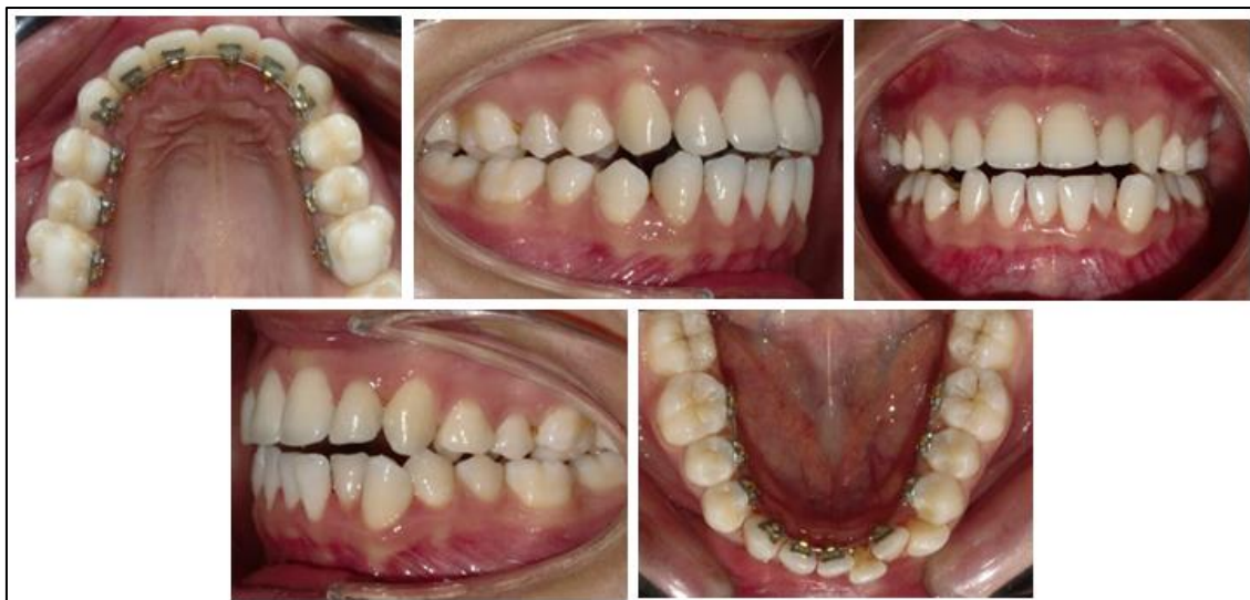
Figure 4: Direct Bonding Technique