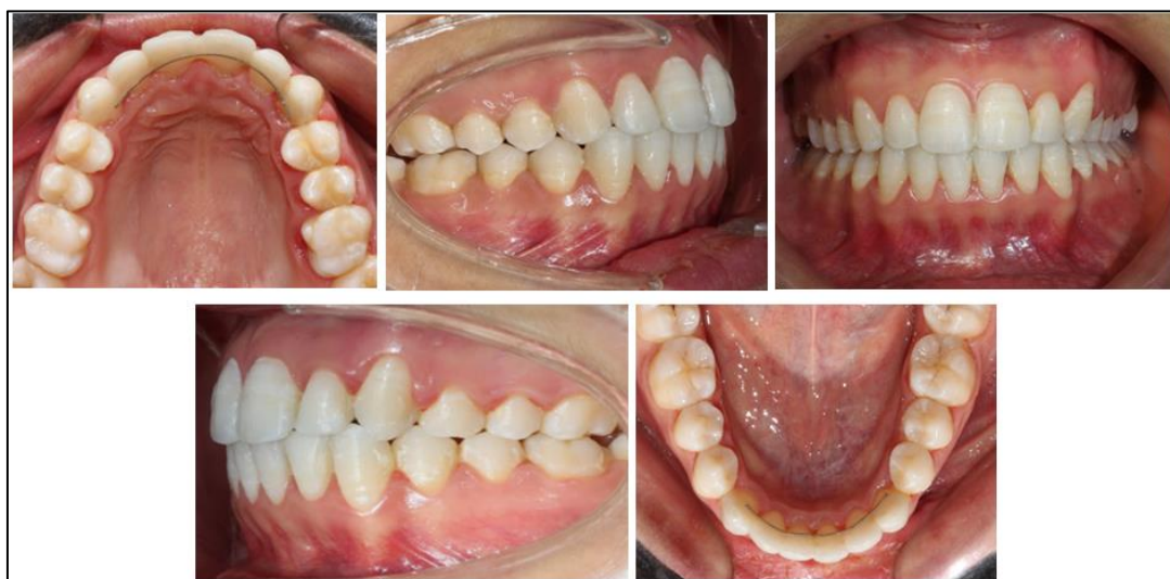
Figure 8: Post-treatment endo-oral photographs