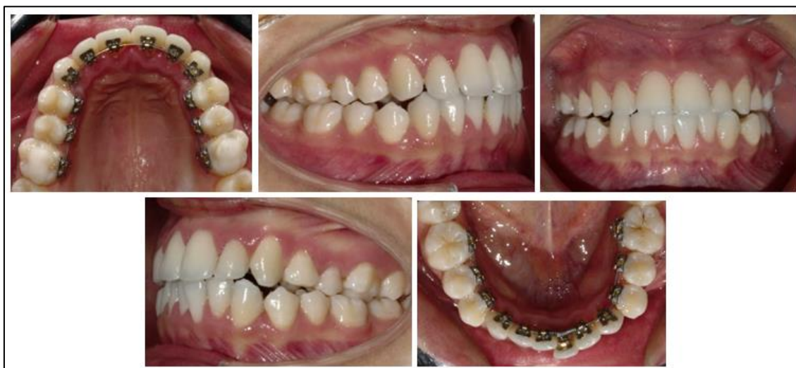
Figure 5: Space opening for the 31 using a compressed spring

After 6 months of treatment, the space was opened for the 31 using a compressed spring.