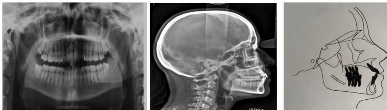
Figure 3: Pre-treatment radiographs

1mm), proclination of the upper and lower incisor ( I/F=118^\circ , IMPA = 105^\circ ), and short facial height ( FMA=19^\circ ).