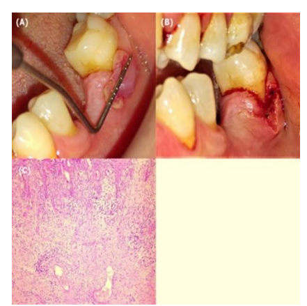
Fig-2: Pyogenic granulom before (A) and post-treatment (B). A histological picture showing mostly the stromal area of pyogenic granuloma (C). Conjunctival vascular structures are seen in edematous, inflamed stroma (HE, X10)

A 58-year-old male was suffering from an overgrowth in the interdental and buccal gingiva of the first molar teeth on the left side of the mandible. The macroscopic appearance of this lesion was a pedunculated mass in the interproximal region of 46 buccal, which appeared almost round in shape. It was reddish pink and covered by cream-colored mucosa. The lesion was approximately 6 \times 3 \times 2 mm, partially stemmed, partially ulcerated, hyperemic appearance on the surface (Fig-2).