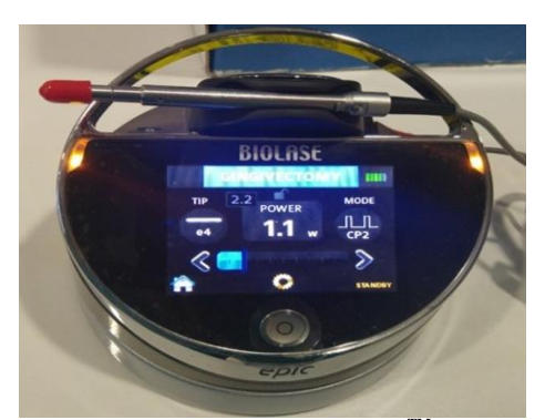
Fig-4: 940 nm wavelength, Biolase Epic 10<sup>TM</sup>, Irvine, USA

After, the specimen sample was put in 10% formalin and then sent for histopathological investigation. After making the routine application of the biopsy specimen, it was preserved paraffin. The 0.5 \mu m sections were made with a microtome and stained with hematoxylin-eosin then examined under light microscope.