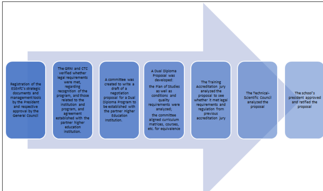
Fig-2: Processing of the International Dual Diploma Program in the ESEnFC, 2018

accordance with the agreement established between the institutions.