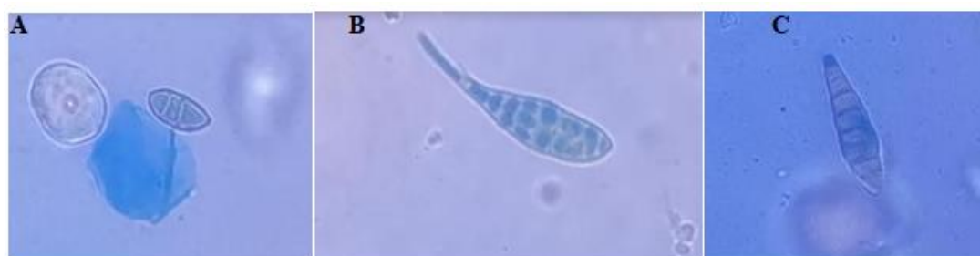
Figure 2: Alternaria sp after staining with lactophenol blue (magnification × 40), showing oval (A) and obclavate (B and C) conidia