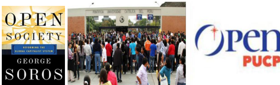
Fig-5: PUC: main promotor of Open Society

This university has created centers of innovation such as Open PUCP that aim to be only brain mapping centers with cerebral internet (Fig-5).