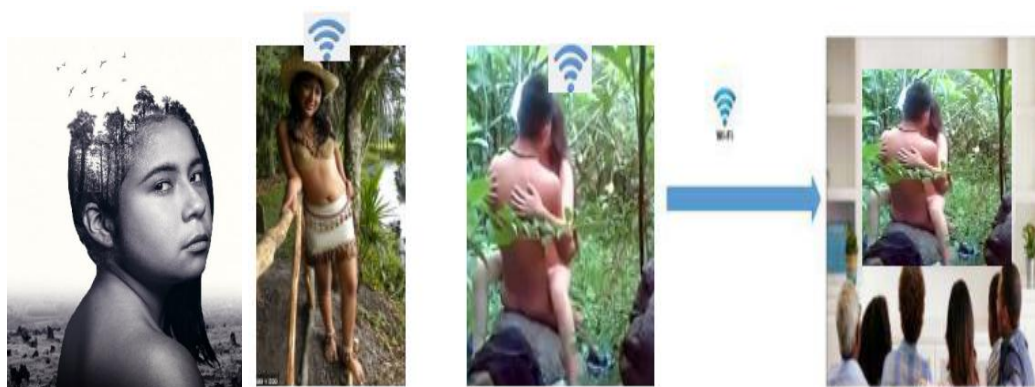
Fig-3: The objective of cerebral internet: The sex life of teenagers of the jungle

In the poster of the publicity of this theater piece, the slogan of the work "this place does not exist" is associated with a paradisiacal image of the jungle and the image of a teenager with an open brain with the cerebral internet thus, the poster reveals the subliminal message that this paradise (the open society with cerebral internet) does not exist yet, however, unfortunately, there are many evidences that alert that thousands of teenagers in the jungle are being spied on with the cerebral internet, thus "the paradise of the jungle with open brain " already exists (Fig-3).