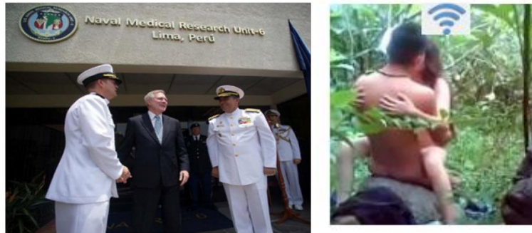
Fig-4: US Navy organize cerebral internet in Peruvian jungle

Naval Medical Research Unit Six (NAMRU-6), the only US military command located in South America (Left). Cerebral internet in the jungle –graphic recreation (Right).