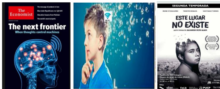
Fig-2: The secret of "This place does not exist: The cerebral internet

The main poster of the play show a teenager with an open brain and a flight of thoughts, an advertising that recreates the transmission of thoughts with brain net, the seagulls that leave the brain of the adolescent simulate the waves wi fi (Fig-2).