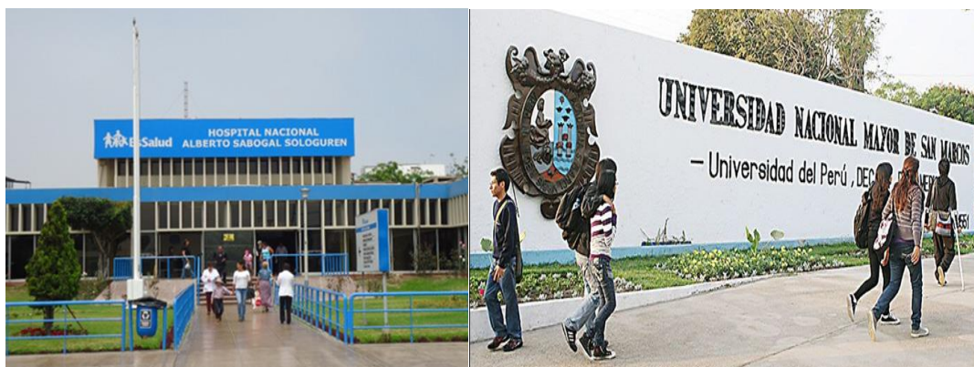
Fig-3: Latin American hospitals and universities: Human Connectome project's Human farms Alberto Sabogal Hospital (Left) San Marcos University (Right).

Source: Left (Human Connectom. Page web) Right (Ref 6)