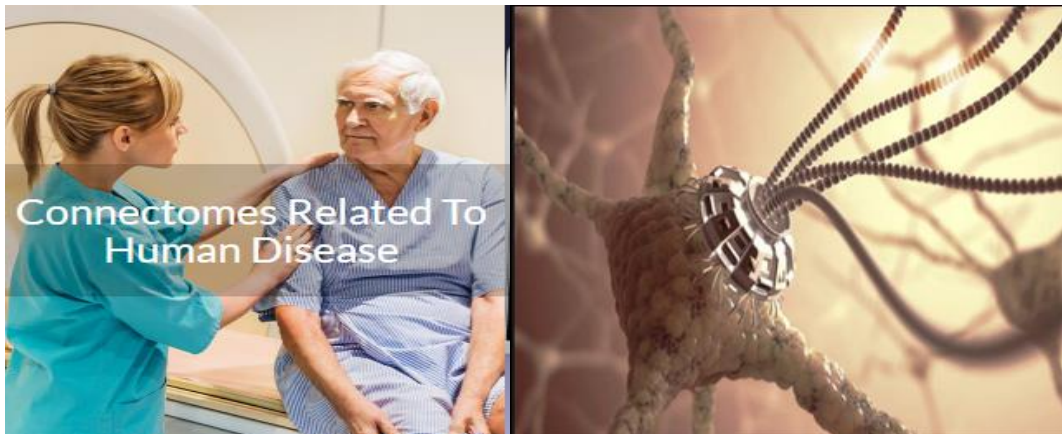
Fig-2: Brain Nanobots: The secret methodology of Human Connectome project Human Connectome project's promotion shows magnetic resonance (Left) Brain nanobots, the real methodology of Human Connectome project