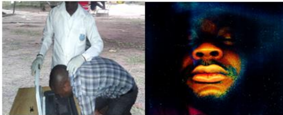
Fig-2: Illustrating the process of data collection with Hp G3110 Photo scanner from the study

the Hp G3110 photo scanner, the prints were magnified using the zooming tool on a Hp laptop connected to the scanner via USB cords. The imprints were magnified using the zooming tool on the Hp laptop connected to the scanner via USB cords, and then divided into four quadrants as upper right quadrant (URQ), upper left quadrant (ULQ), lower right quadrant (LRQ) and lower left quadrant (LLQ) to identify the predominant type of lip pattern according to Suzuki and Tsuchihashi (I, I', II, III, IV, V). The data gathered was computed in Excel sheet.