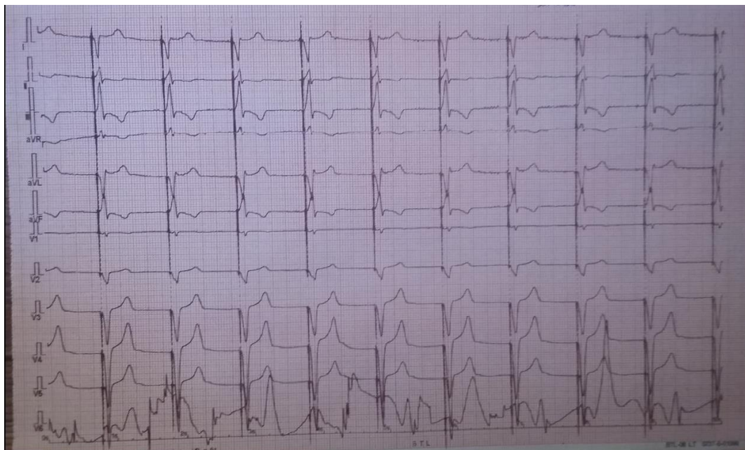
Fig-1: 12 lead ECG showing paced rhythm at 60 bpm