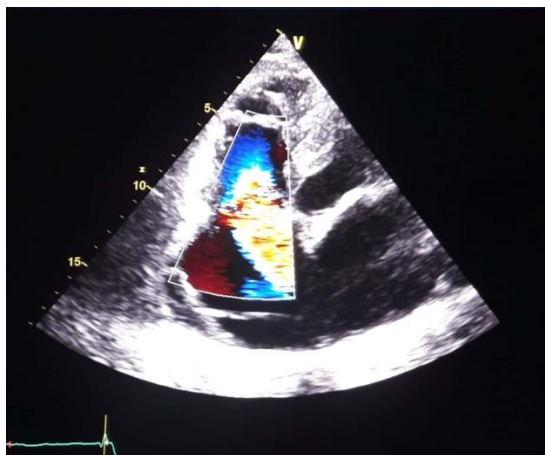
Fig-3: Transthoracic echocardiography showing massive tricuspid insufficiency