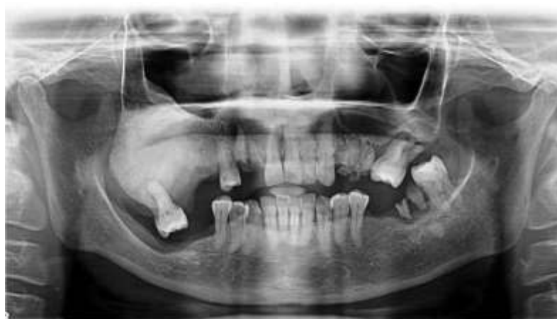
Fig-2: Orthopantomograph depicting the pathology in right maxilla