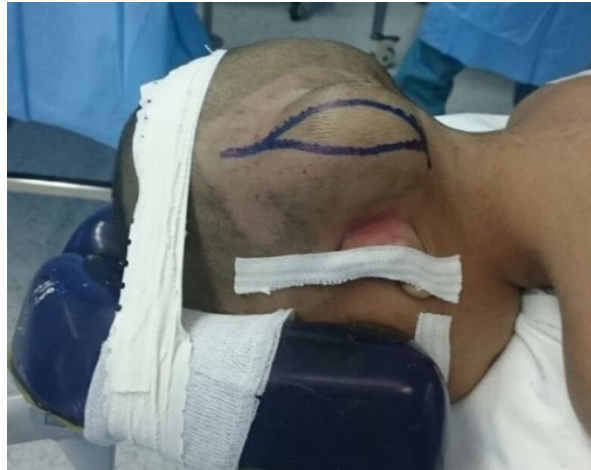
Fig-1: Preoperative image of the patient showing the occipital retromastoid mass and the operative incision planning