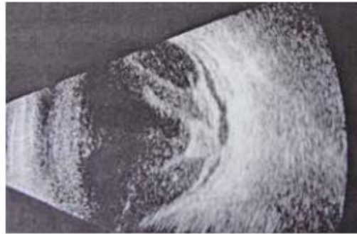
Fig-2: Ultrasound appearance of associated papillary angioma intravitreal haemorrhage