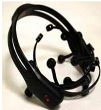
A wireless noninvasive signal capturing device

The wireless EEG acquisition module receives EEG signals from the dry EEG sensor and it has the following components such as a microprocessor component, an acquisition component, and a wireless transmission component. To intensify the signals and filter the EEG signals, a band-pass filter (0.5-50 Hz), a pre-amplifier and an analog-to-digital converter (ADC) were implanted into the circuit board as a bio-signal amplifier and acquisition component modules.