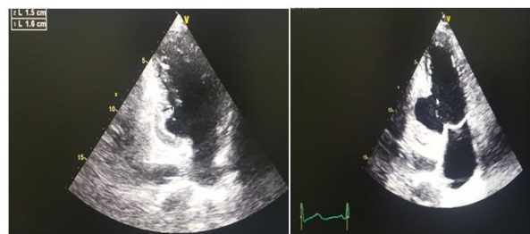
Huge aneurysm of the inferorir wall

occurring a week after a neglected infarctoid scene. The examinations carried out had revealed an aneurysm of the inferior wall complicated with thrombus. The evolution was marked 15 days later by the occurrence of a heart failure complicating a reduced ventricular tachycardia.