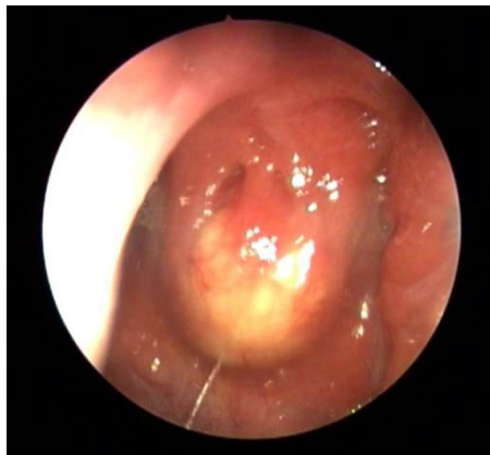
Fig-1: Endoscopic appearance of the Tornwaldt cyst