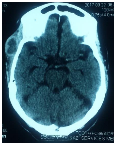
Fig-2: computed tomography in axial section: Intra temporal muscle abscess