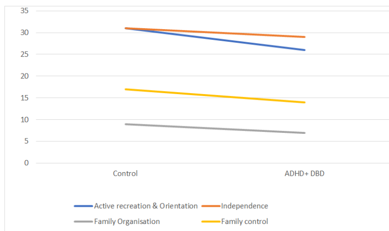
Fig-2: Comparison of median scores of Active Recreation-Orientation, Independence, Family organisation and Family control components of FES among ADHD+ DBD cases and controls