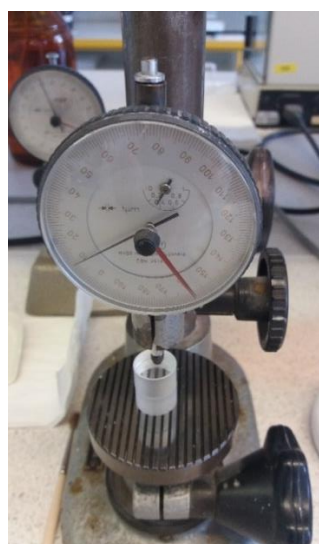
Fig-4: Samples on etching gel in under 15 kg force in mico meter

15 kg for 1 minutes (according below picture). Samples was transferred to micro meter and thickness was measured.