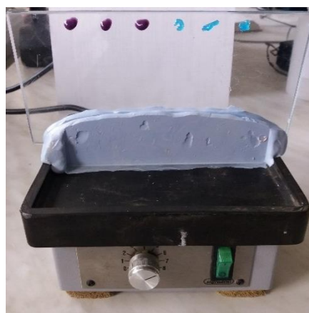
Fig-1: Samples before test extracted directly from syringes

Three samples of gel 0.1 g each was applicable on beginning directly from syringe and after using a needle 0.55 mm. Samples left on the vertical glass doesn't move for 10 minutes (testing time). New portion of gel was extruded on the glass slab and it was fixed in vibration table and instrument was switch on during 10 second in vibration speed nb.6. Distance made by each gel was measured after end of test. Performed tests and results are in photos below.