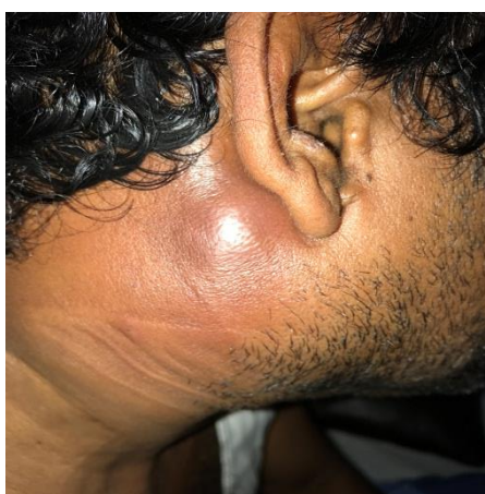
Fig-1: Showing right side neck swelling

Thus the diagnosis of primary tuberculosis parotid gland was made and patient was started on anti tuberculosis treatment containing rifampicin, ethambutol, isoniazid and pyrazinamide.