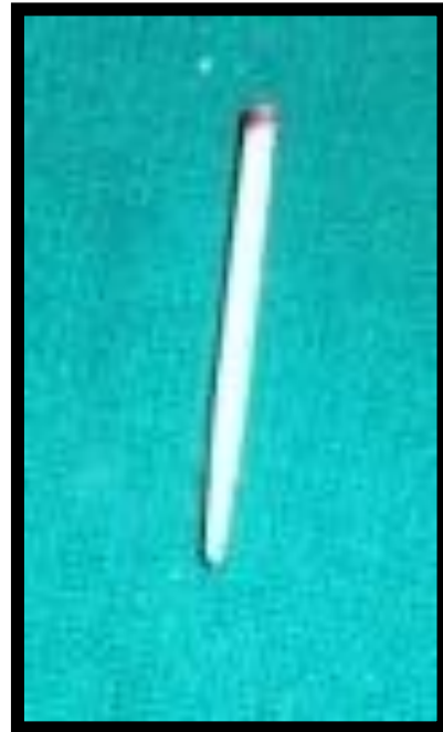
Fig-5: Glassix fibre post