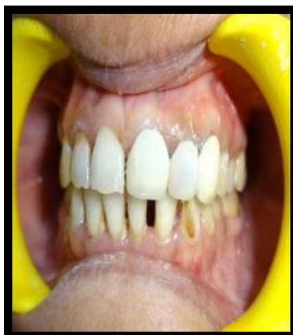
Fig-8: ALL CERAMIC crowns in relation to 21, 22 & 23