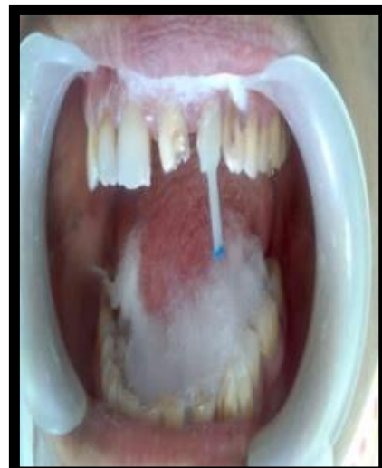
Fig-6: glassix fibre post luted in place