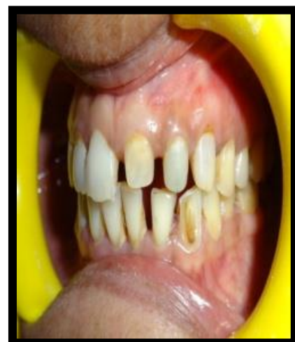
Fig-7: composite buildup of 22