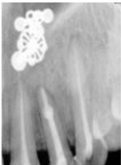
Fig-4: obturation with thermoplastized guttapercha technique