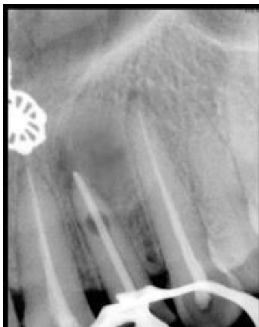
Fig-3: IOPA showing master cone determination