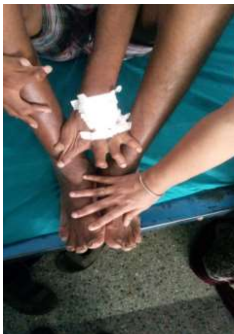
Fig 3: Hands and feet showing syndactily and camptodactily