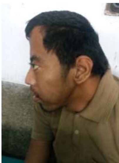
Fig 2: Profile showing depressed nasal bridge, prognathism, low hairline