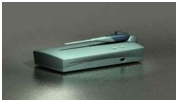
Fig-1 (a): Truscreen optoelectronic device