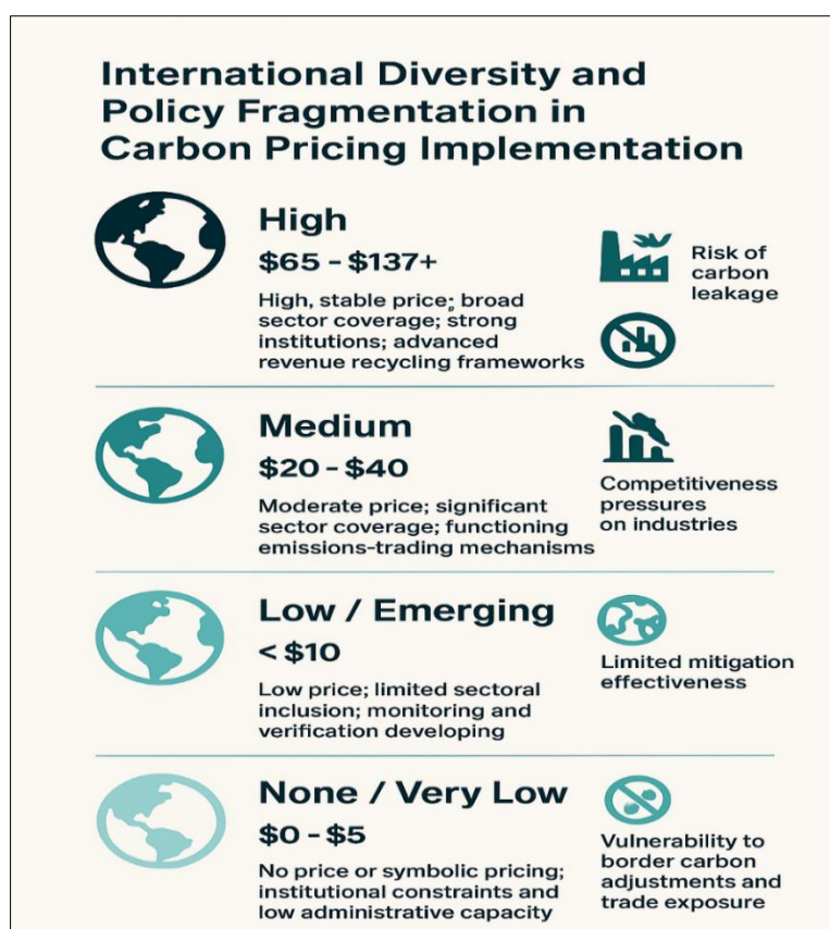
Figure 2: International Diversity and Policy Fragmentation in the implementation of carbon pricing

Figure 2: illustrates that policies of carbon pricing vary across countries and regions in terms of price levels, coverage, institutional strength, and utilization of revenues. The implementation failure leads to price distortions, the threat of carbon leakage, and competitiveness problems; the global governance should be harmonized (Dobbeling-Hildebrandt et al. , 2024; OECD, 2023; IPCC, 2022).