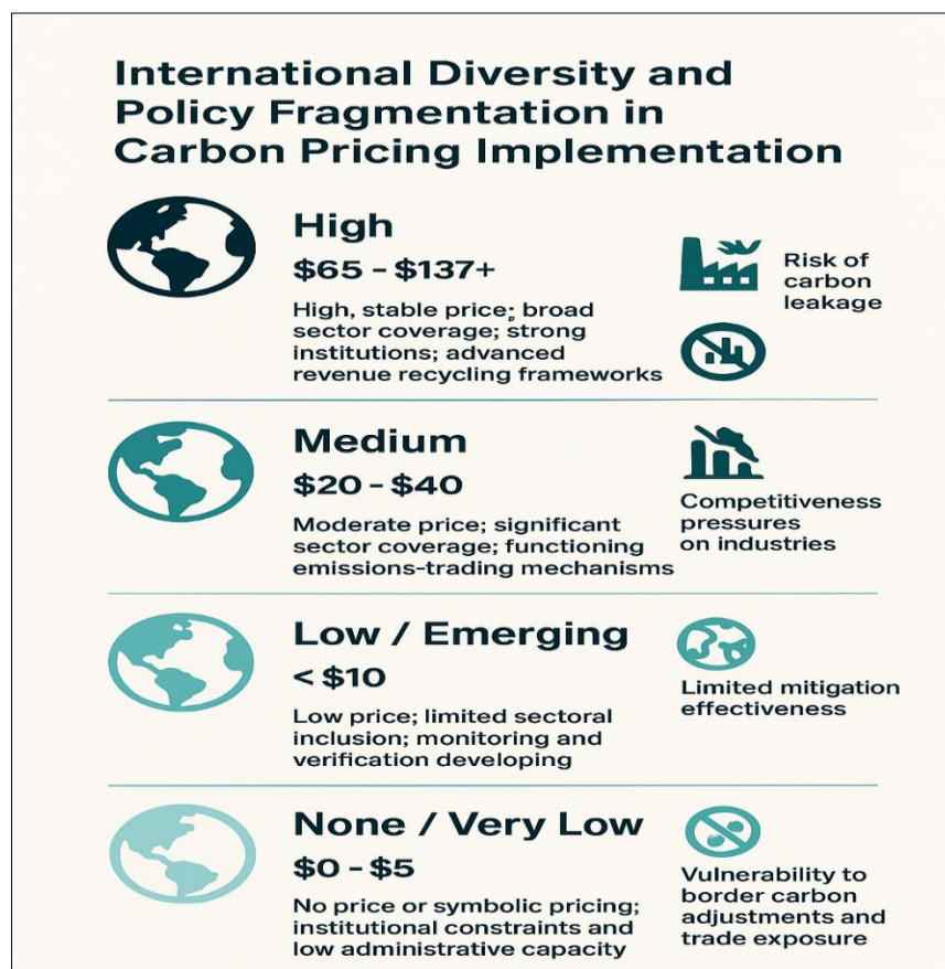
Figure 2: International Diversity and Policy Fragmentation in the implementation of carbon pricing

Global Strategic Considerations: Policy Coordination, Trade and Governance: Carbon pricing is not a concept that operates on its own especially in the contemporary globalized economy. In a situation where a number of countries implement high prices, and others do not, border leakages will occur, jeopardizing the objectives of climate and competitiveness. There is a need to coordinate international policies. Such instruments as border carbon adjustments, standardized emissions accounting, and international agreements can be used to provide a level playing field and to make carbon pricing more effective. However, it is possible to design policies that reinforce each other and not weaken the other when the countries act predictably, transparently, and collaboratively (Aldy & Pizer, 2015; OECD, 2023)