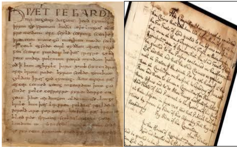
(a) (b) Figure 1: Degraded Historical Documents