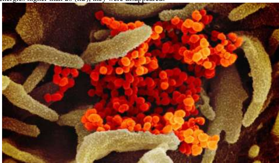
Ritonavir Effectiveness on Coronavirus Disease–2019 ( COVID–19 ) Infection

Ritonavir is an antiretroviral of the protease inhibitor class. It is used against HIV infections as a fixed-dose combination with another protease inhibitor, ritonavir (lopinavir/ritonavir). In the current research, the stimulated FT–Raman biospectroscopy of liquid sample of Ritonavir was investigated. The stimulated FT–Raman diffractions emitted through focusing the second harmonic laser beam Nd:YAG into the sample were recorded by Echelle spectrometer and ICCD detector. Increasing the energy of laser beam from 2.6 (mJ) to 16 (mJ) was led to increase in stimulated FT–Raman signal but after breakdown threshold of liquid sample, more increasing of energy was led to decrease in stimulate FT–Raman signals and for energies higher than 20 (mJ), they were disappeared.