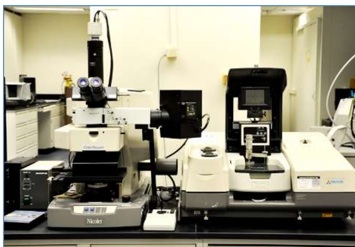
Fig-1: Schematic of stimulated FT-Raman biospectroscopy test arrangement

The experimental arrangement used in the current study is schematically shown in Figure (1). The first harmonic bicolor mirror reflects 1064 (nm) but passes the second harmonic one. As a result, the first harmonic removes from laser beam. The second harmonic laser Nd: YAG with wavelength of 532 (nm) and pulse width of 8 (ns) interacts with the sample after passing through bicolor mirror and lens with focal length of 3.5 (cm). The resulted emissions from this interaction filter by an optical system consisting some lens and optical fiber conducts to Eschelle spectrometer. The necessary time range for collecting spectra and its start time in ICCD detector controls by delayer device. Optical emissions of sample collects and intensifies from the striking moment of laser to sample until 5 (ms) after that moment. Test was repeated five times for each energy level for laser energy from 2.4 (mJ) to 29 (mJ).