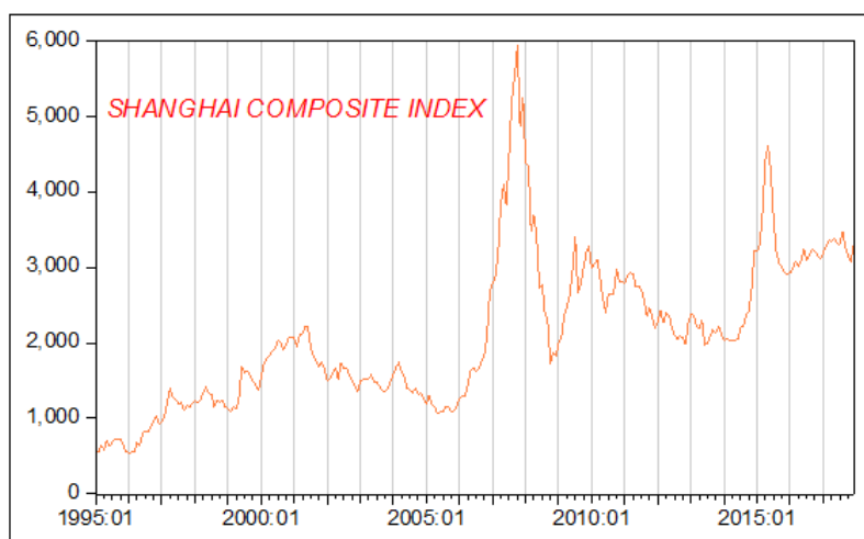
Fig-1: Monthly Changes in Shanghai Composite Index (1995-2017)

We argue that the loan interest rate shock in 2007 might cause a structural change in security markets such as the A-Share Market in China. The real estate sector is money intensive. The interest rate shock must markedly reduce the flow of funds into this sector. Stock prices are sensitive to changes in interest rates [3]. There is a lead-lag relationship between them [4]. In particular, real estate securities are very susceptible to interest rate movements [5]. Interest rates have a significant adverse effect on share prices [6].