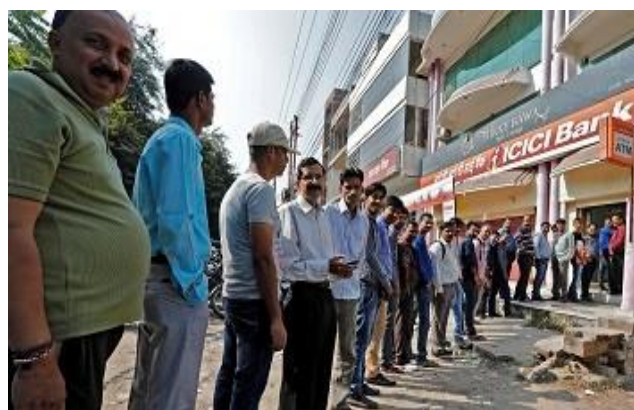
Fig-2: Queue outside a Private Bank Following Demonetization