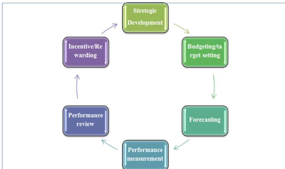
Fig-1: Process of Strategic performance Management System

continuous process. It basically involves managers and other acting partners within a framework. The SPSM process is made up of different subordinate phase's like- strategy development, budgeting, performance measurement parameters, deciding target employees, provides a rough draft on which the performance is to be measured.