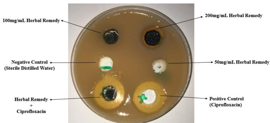
Figure 4: Shows the zone of inhibition of Gbogbonise Epa Ijebu Herbal Remedy on K. pneumoniae