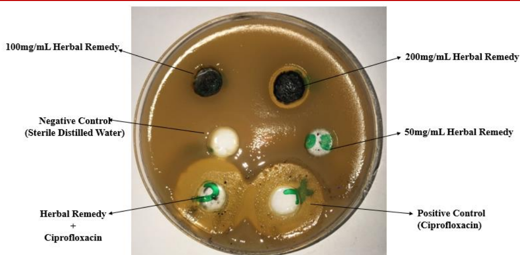
Figure 3: Picture showing the zone of inhibition of Gbogbonise Epa Ijebu Herbal Remedy on E. coli