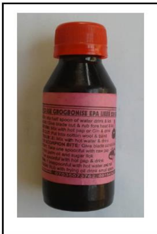
Figure 1: Gbogbonise Epa Ijebu 200 Cure