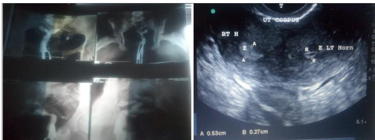
Fig 1 & 2: Pre-operative HSG and Pre-operative transvaginal sonography respectively

Ante-natal was uneventful except for heightened anxiety during the first trimester and third trimester. She had a male neonate following an elective caesarean section at 39 weeks.