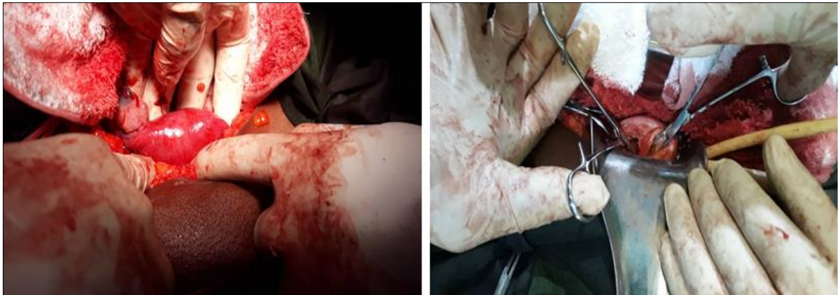
Fig 3 and 4: Images of external surface of uterus pre metroplasty and probes in both halves of endometrial cavity during open metroplasty respectively