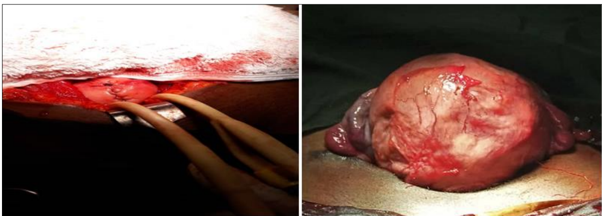
Fig 5 & 6: Images of Post metroplasty appearance of external surface of uterus and post caesarean section appearance of uterus respectively.