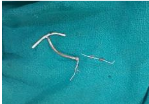
Fig-5: Image of complete Copper T, retrieved from urinary bladder with both horizontal limbs, vertical limb and both threads