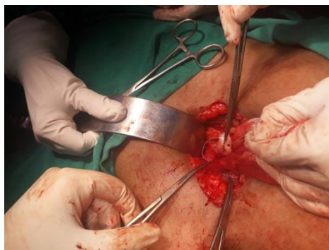
Fig-2: Laparotomy image showing Copper T thread outside the bladder wall

Figure below Laparotomy image showing Copper T retrieval from urinary bladder.