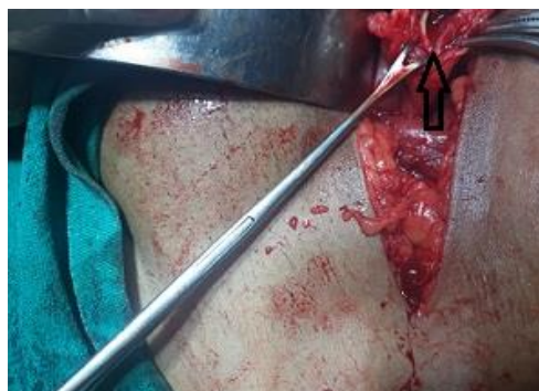
Fig-3: Laparotomy image showing vertical limb of Copper T retrieved from the cavity of urinary bladder