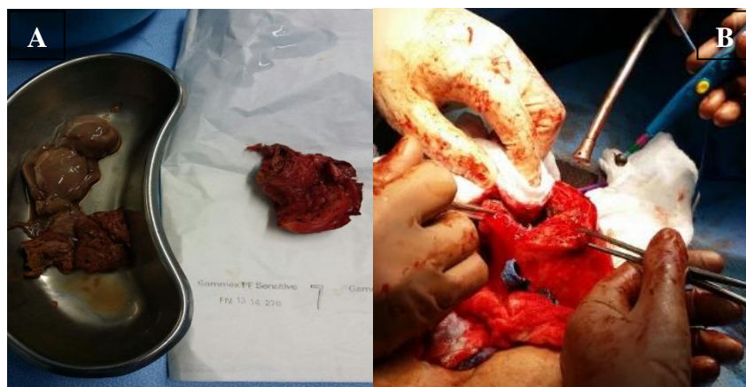
Picture-2: A: Left Rudimentary Uterine Horn after Excision. B: Product of Conception

Patient had a smooth post-operative course without complications. Discharged home on day 2 post op on combined contraceptive pills and given follow up in 3 months.