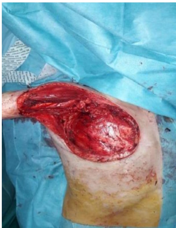
Fig-5: Enlarged tumor excision exposing the axillary pedicle

thus benefited from an enlarged tumor excision with lateral margins of safety at 3 cm reaching deep to the ribs and laying bare the axillary pedicle (Figure-5) which was covered by a large latissimus dorsi muscle flap (Figure-6).