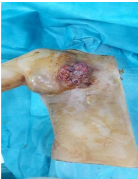
Fig-4: Bulky subcutaneous recurrence of a phyllode tumor, fixed to the anterior pillar of the axillary hollow

The rest of the general exam did not find any signs in favor of a secondary location. Thoracic MRI has put in evidence a 12 cm x 8 cm right parieto-axillary bud bursting tumor in contact with the axillary pedicle, without secondary localization. The patient