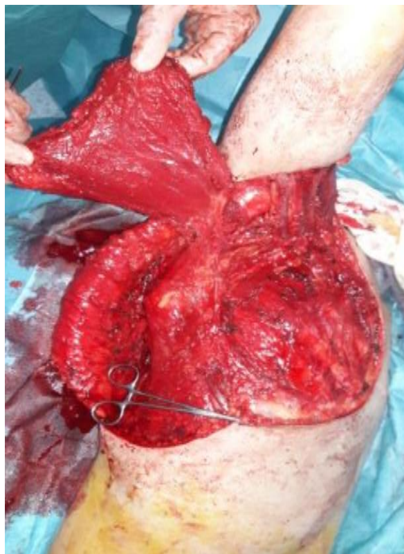
Fig-6: Coverage of the axillary pedicle by a latissimus dorsi muscle flap

Secondarily, the residual loss of substance was covered by a thin skin graft. After healing, the patient was referred to oncology to continue her sessions of radiotherapy. After six months of evolution, a control MRI revealed pulmonary nodules as well as bone lesions at the humeral level.