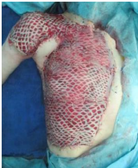
Fig-3: Thin skin graft coverage

The anatomopathological study of the operative specimen revealed tumor transformation into myxoid sarcoma compatible with liposarcoma of complete exeresis. The patient was directly addressed in oncology to benefit from a therapeutic complement by radiotherapy.