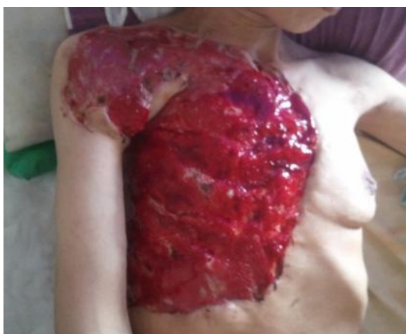
Fig-2: Appearance after budding of enlarged post-excisional loss of substance

margins of safety laterally, reaching deep to the ribs. After budding (Figure-2), the loss of substance was secondarily covered by a thin skin graft (Figure-3).