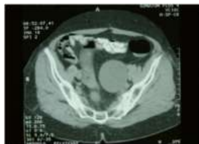
Fig-2: Pelvic computed tomography; axial section: Homogeneous left retro-mass and subperitoneal mass not enhancing after injection of the contrast product

The surgical exploration performed by laparotomy found a retroperitoneal tumor, the direct approach allows easy excision of the tumor, the operative follow-ups were simple. Histological examination of the surgical specimen confirmed the diagnosis of benign schwannoma type B. Clinical and paraclinical monitoring, in particular by CT scan, did not show local recurrence over a 5-year follow-up.