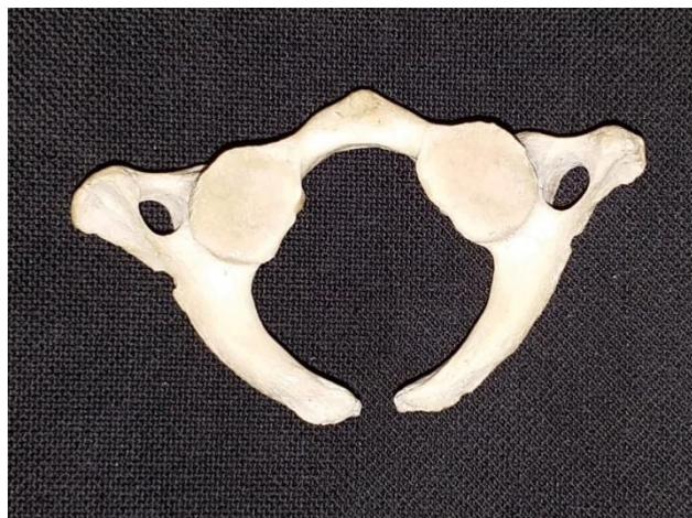
Fig-2: Atlas Vertebra deficiency in posterior arch