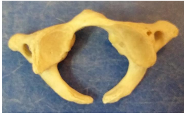
Fig-4: Atlas Vertebra deficiency in posterior arch