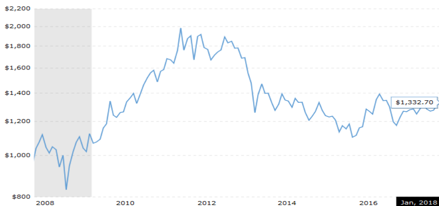
Fig-1: World Gold Prices in USD/Oz since 2008- 2018

but subsequently increased throughout the same 10-year period. The current price of gold as of January 22, 2018 is RM 5,250.72 per ounce. Much is to be learned about what contributes towards the rise and fall of gold price of the study.