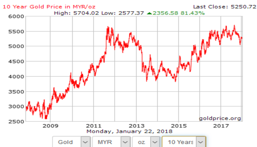
Fig-2: Gold Prices in Malaysia Ringgit (MYR) (oz) since 2008- 2018

(Source: http://www.macrotrends.net/1333/historical-gold-prices-100-year-chart )