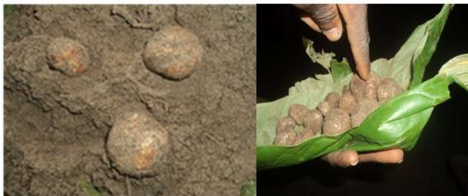
Fig-2: The mushroom in soil and harvested

This vegetal species used by hunters as bait has a weigh average of 15 g, spherical shape (diameter comprised between 3 and 5 cm), sometimes irregular and bumpy black, covered with prominent pyramidal warts. Firm flesh, at first clear, then black-purple and traversed by white veins, sinuous and very tight, blushing in the air, a very powerful and aromatic odor. This description is similar to that of Polesse [11] for a mushroom called Tuber nigrum .